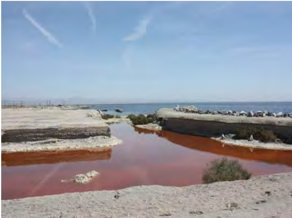
Photo of Bombay Beach marina on east side of Salton Sea, March 2013. This is now completely dried up as a result of dropping lake level.

these impoundments and some hypersaline, fish- and invertebrate-free brine pools that will remain in the deepest pockets of the basin. As the lake shrinks, tens of thousands of acres of lake bed will be converted into a dry, salty pampa. During windy days, this shrinkage will lead to large increases in particulate air pollution in a region where there already are severe health problems due to this.